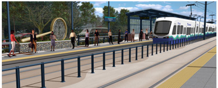
Artist's conception of the Columbia City LINK Light Rail station, located within walking distance of the subject site.

Exceptional builder opportunity to purchase a 24-unit townhome development site in the vibrant and rapidly appreciating Columbia City neighborhood. Project site is being sold with architect's plans, survey, geotechnical study, civil and structural engineering, and more. All required permits available to begin construction.