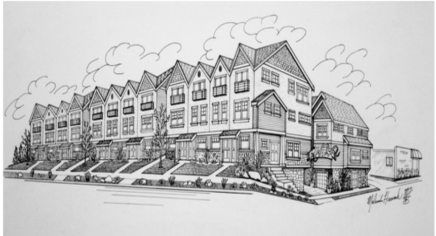
Artist's rendering of completed project

Exceptional builder opportunity to purchase a 24-unit townhome development site in the vibrant and rapidly appreciating Columbia City neighborhood. Project site is being sold with architect's plans, survey, geotechnical study, civil and structural engineering, and more. All required permits available to begin construction.