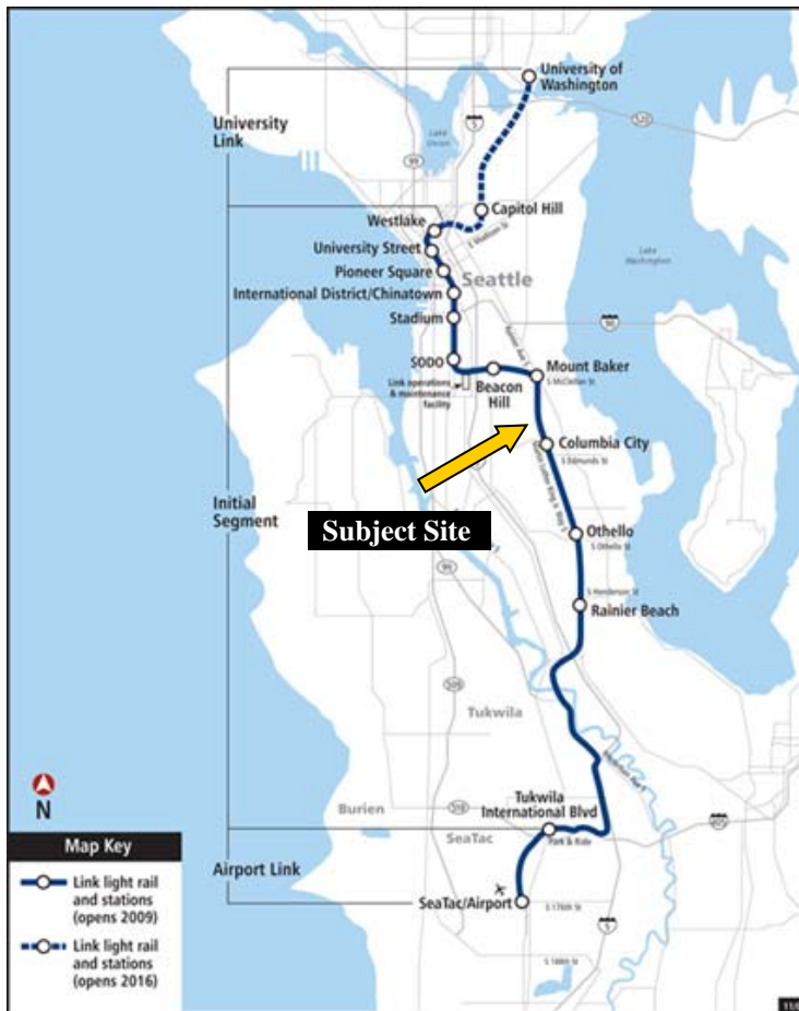
Project map from Sound Transit which depicts current and future light rail stops.

The station is just one of thirteen which dot the 13.9 mile rail line. A second phase of the light rail is currently being developed, which will eventually bring commuters through Capitol Hill and ending at the University of Washington. At its completion, light rail will total 15.6 miles. To encourage ridership and make the experience enjoyable and safe for pedestrians, the city has also improved sidewalks and installed signaled crosswalks along the light rail line.