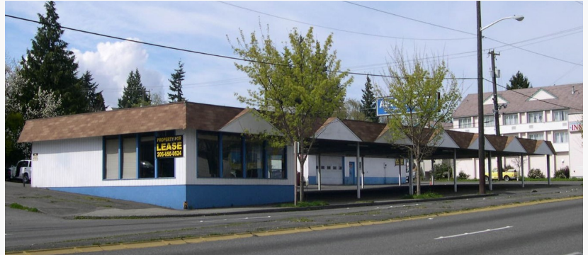
One of three structures on site, this an 800 sq ft office building with attached canopy. Building ceiling height is 9'9" with 8'10" overhead door.