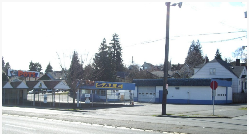
Property includes 1,920 sq ft garage building with roll up doors and half bath. Ceiling height is 11'2", 2 roll up doors of 9'6" and 10'.