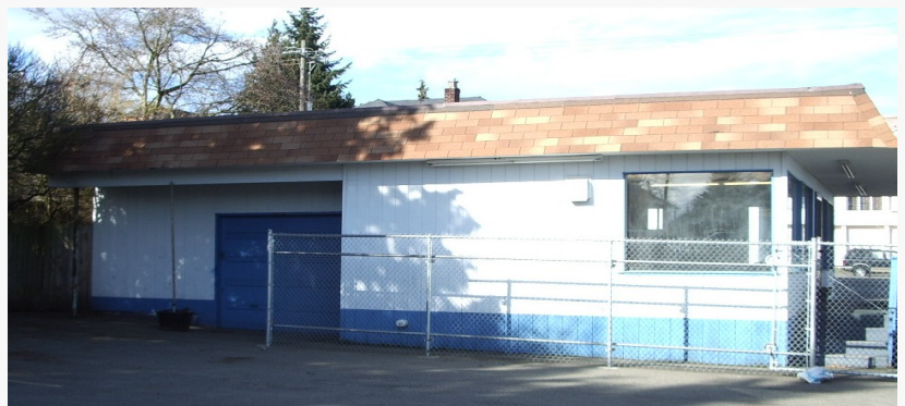
The third structure is a 600 sq ft office building with half bath and workshop area.