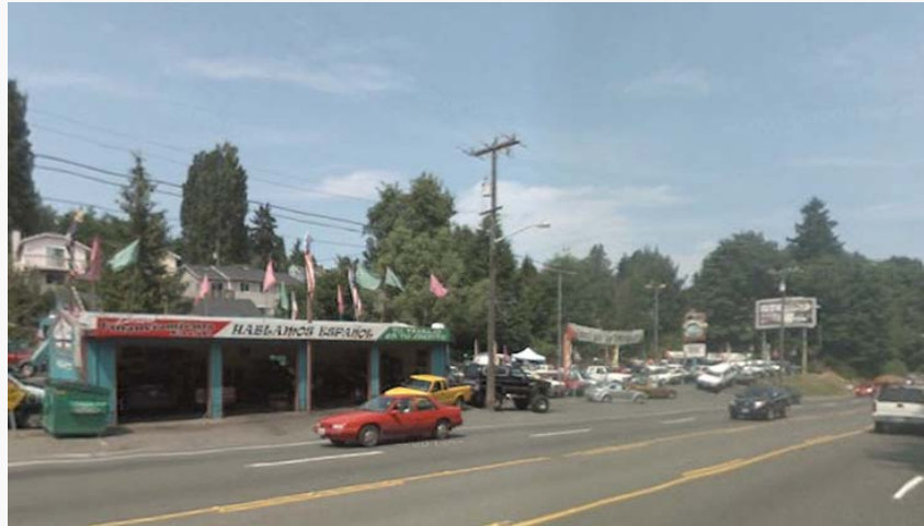
Expansive property of 28,876 sq ft