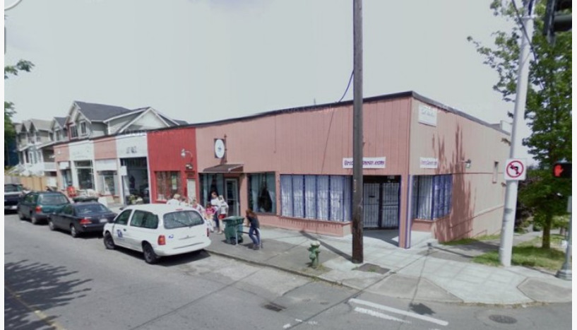
Corner retail building in popular Central district location