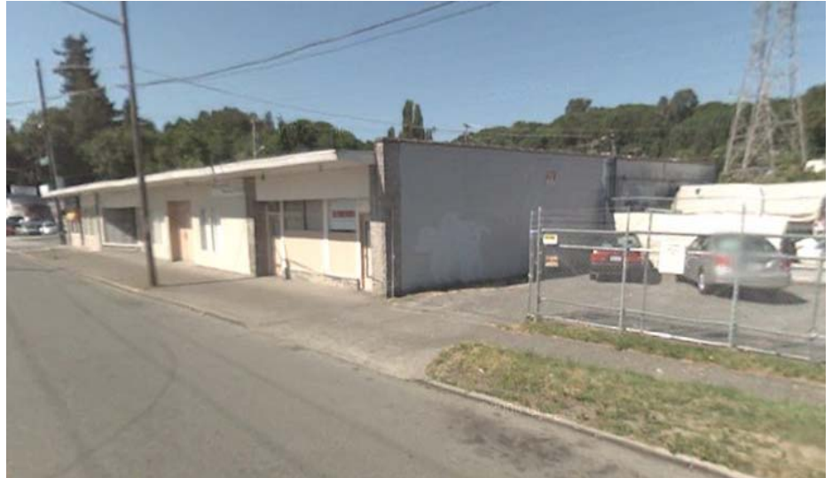
Property includes a four-tenant commercial building and adjacent parking lot