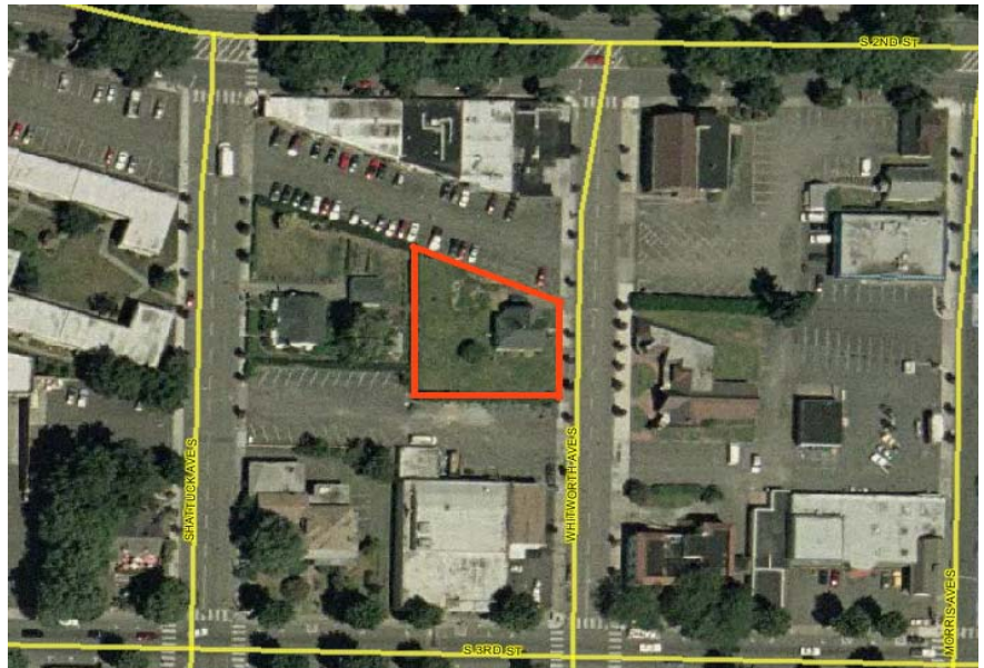
Development site offers corner lot location and level topography