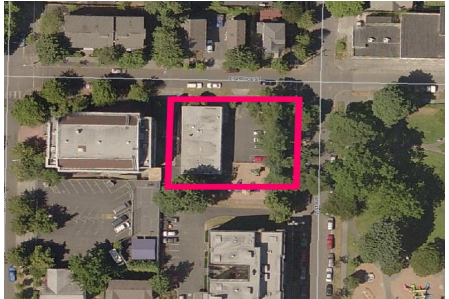
Development site is located on the corner, across from neighborhood park